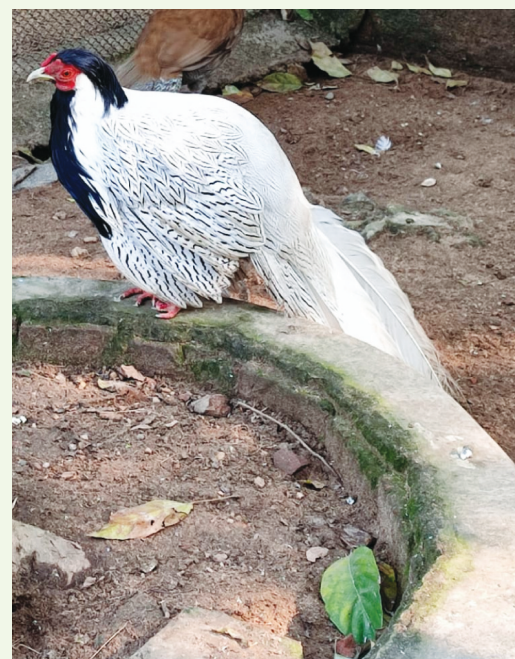
Chinese Silver Pheasant