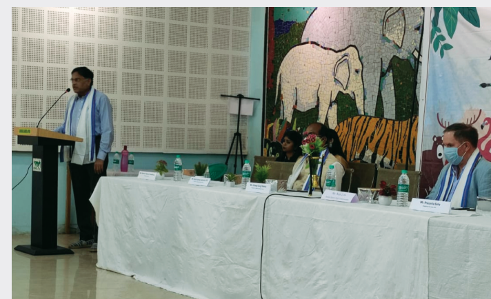
Eminent Guests and Zoo officials at the programme