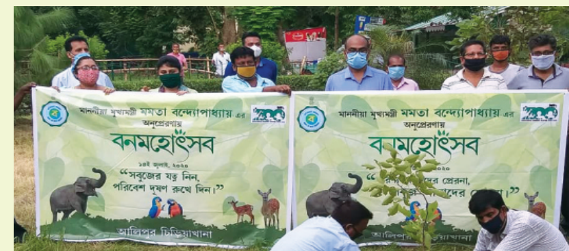
Zoo Officials and Staff at the Vanmahotsab at ZGA

A tree plantation programme with the Officials and Staff of Zoological Garden, Alipore was organized on 14th July, 2020 on the occasion of Vanmahotsab. A total of 50 saplings were planted all over the zoo on the day.