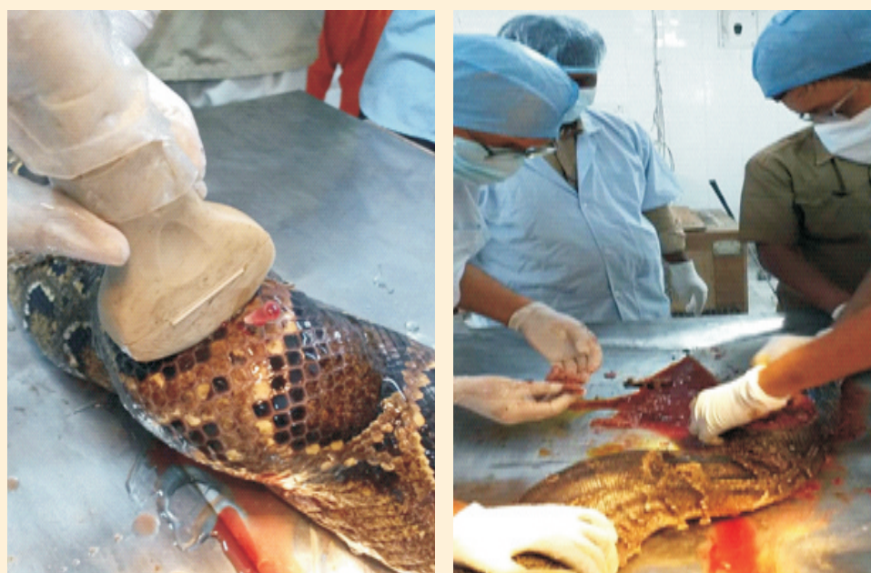
USG and removal of abscess in a Burmese Python