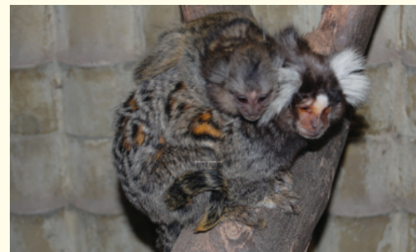
Common Marmoset Mother with Baby