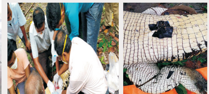
Cloacal prolapse management in a Salt Water Crocodile