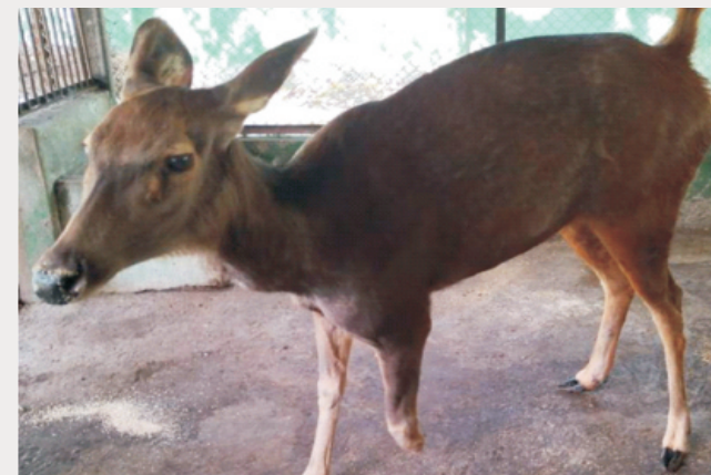
Sambar Deer after partial limb amputation