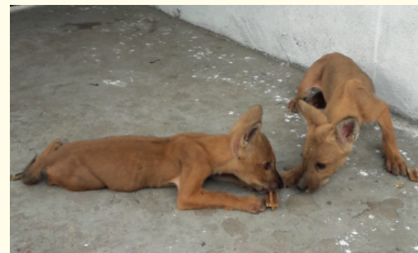
Wild Dog Pups