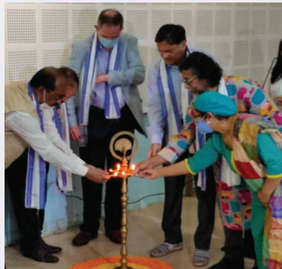
Inauguration of the Art Camp

An art camp with many renowned artists was organized at the zoo premises by SDF and NSHM Knowledge Campus on 14th and 15th February, 2021. Many renowned artists came to the zoo to draw pictures on wild animals and the money coming from the exhibitions of these will be spent for the welfare of the animals of Zoo.