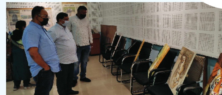
Guests visiting the paintings