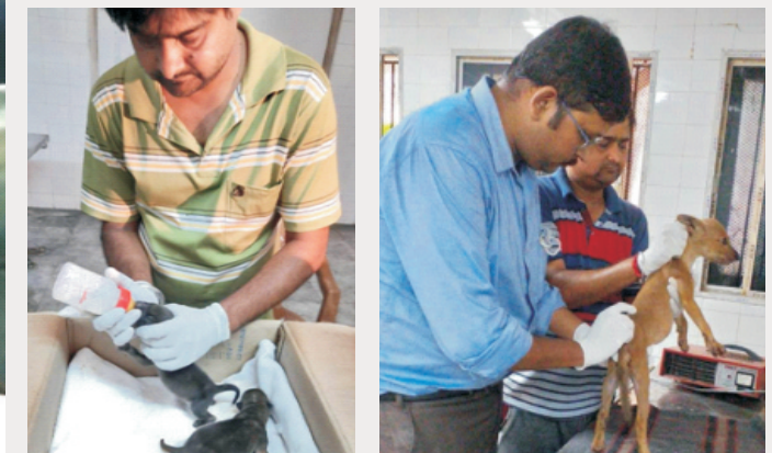
Hand rearing of wild dog puppies rejected by their mother