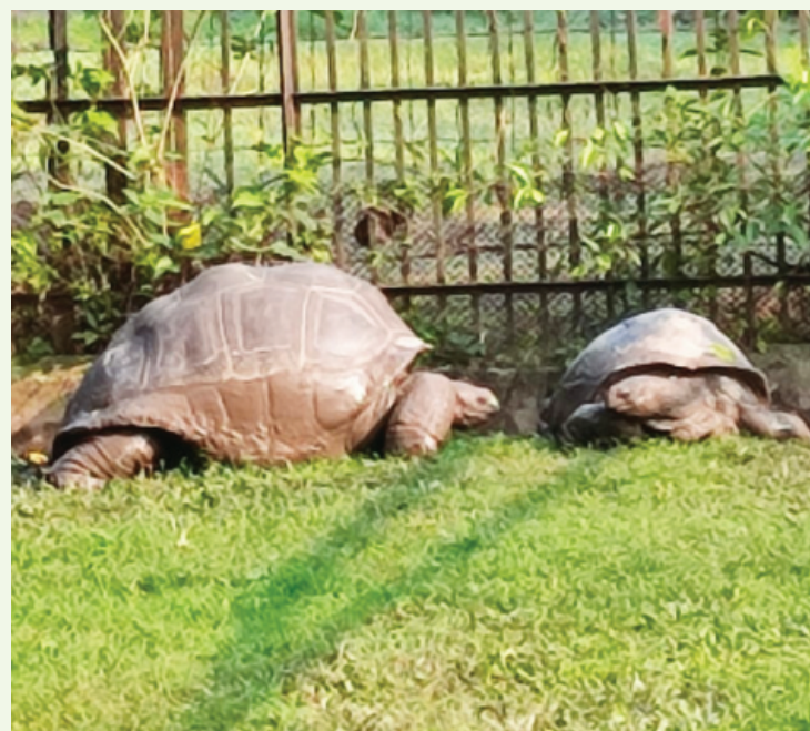
'Katha & Koli'-the pair of Aldabra Giant Tortoise