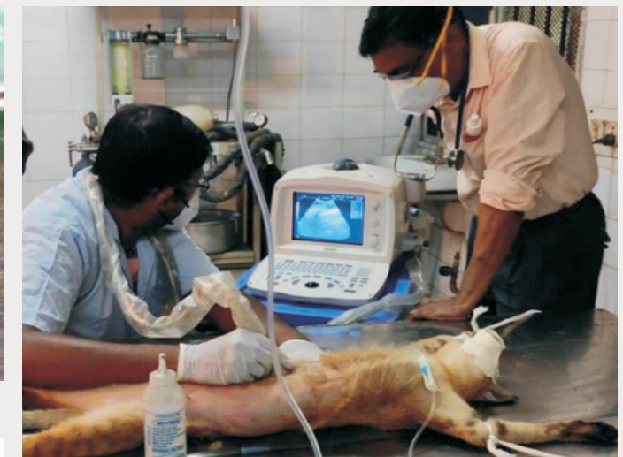
USG in a female Jungle Cat for detection of uterine abnormality