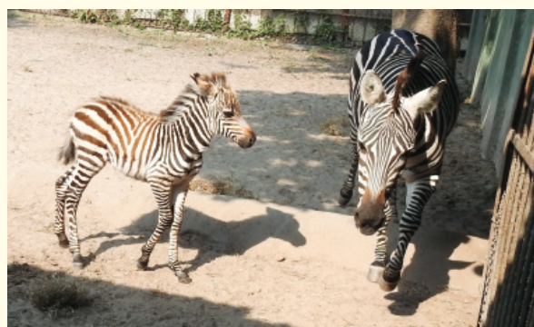
Zebra Foul with Mother