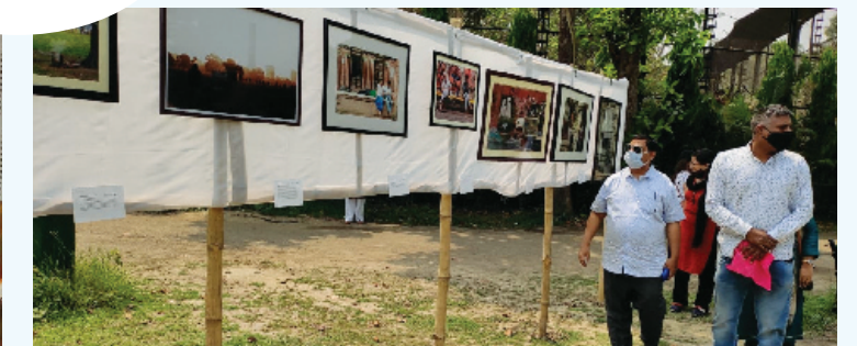
Guests visiting the exhibition