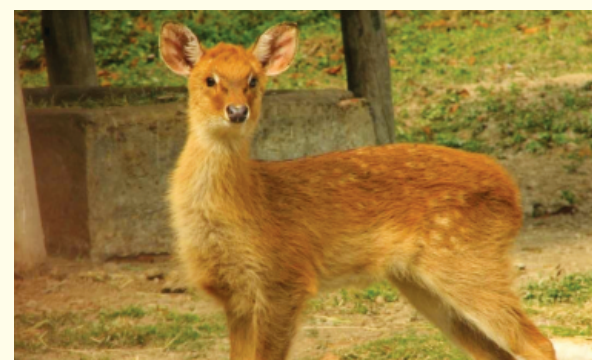
A Brow Antlered Deer Fawn