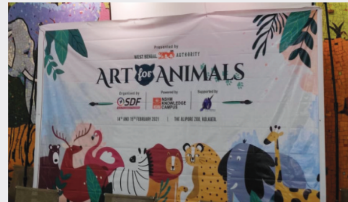
Art for Animals-Art Camp at Zoo