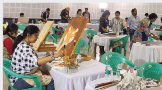
Artist working on their paintings