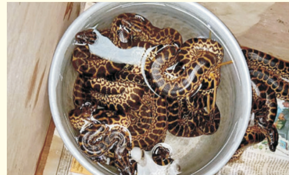
Yellow Anaconda Babies